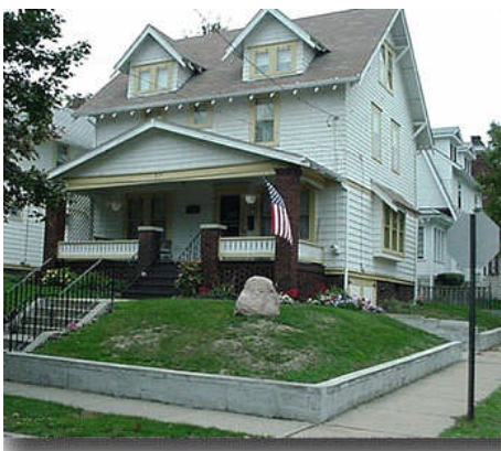
Where it all began