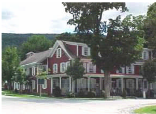
Hotel owned by Bill's Grandparents—