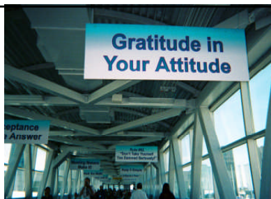
World Conference Toronto 2005

Fewer than 1600 days till San Antonio World Conference July 2010, Save $1 a day and You can go first class! It's OK to plan, just don't plan the results!