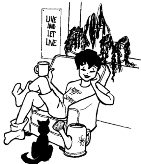
My sponsor says the good thing about procrastination is that you always have something planned for tomorrow.